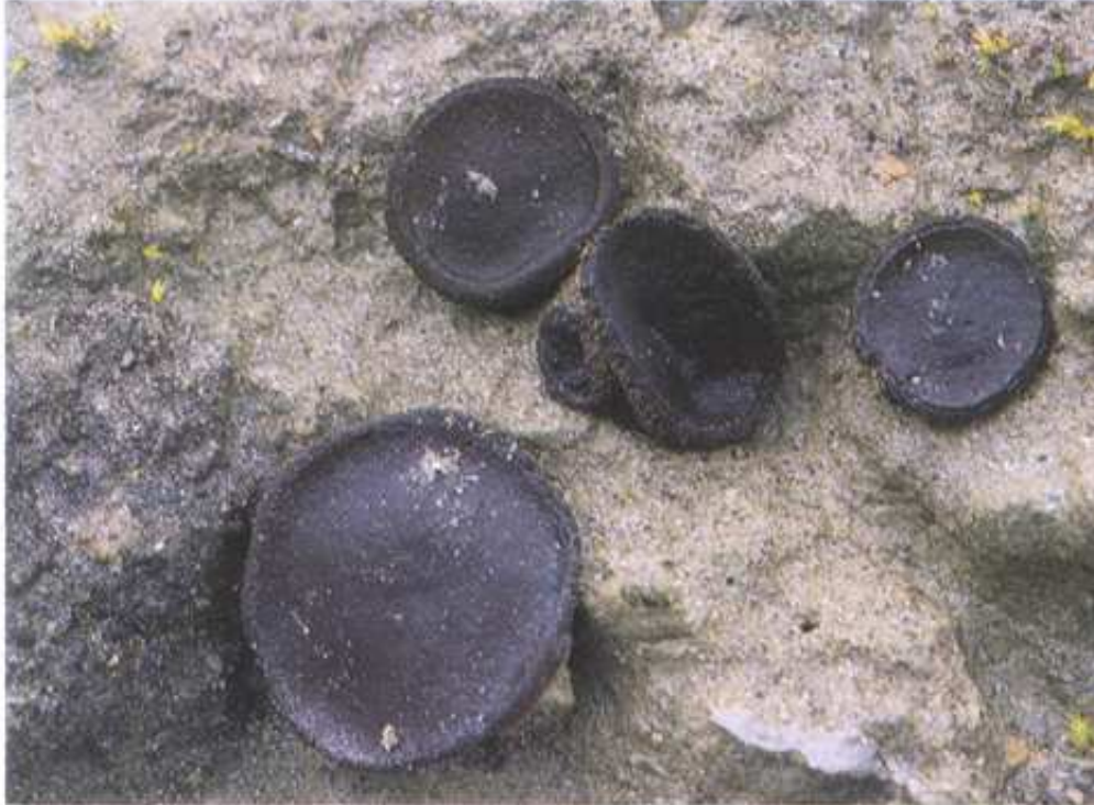
TS 68/89, Norway: Oppland, Dovre, Tverrådalen, 950 m, on sandy, calcareous soil in expulsion slope of the river Tverråi, 6 August 1989. x: 2.2.

Apothecia sessile, cupulate to discoid, 0.3-1.8 cm in diam., with a prominent and commonly incurved margin. Hymenium deep purplish black, outside concolorous or more dark violaceous, delicately, granularly pubescent.